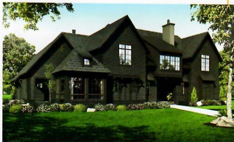
2020 Southern Living Showcase Home by Southern Cottage Corporation